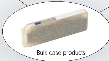
Bulk case products