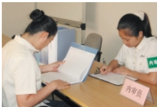
Internal environmental audit underway at Suzhou Murata Electronics in May 2004

At each production plant and production subsidiary, we have established a management standard for day-to-day business and are continuing with the discovery and correction of noncompliance and monitoring of operations. In addition, we undertake internal audits at fixed intervals every year, and we undertake activities to correct any issues detected as a result. In this audit, we take steps to determine whether the various prescribed rules are being followed correctly. This plant internal self-audit has been undertaken at each production plant and production subsidiary since the formation of the plant environmental management system from 1997 to 1999. We intend to upgrade the skills of the auditors by re-training and by building on the experience gained during internal environmental audits.