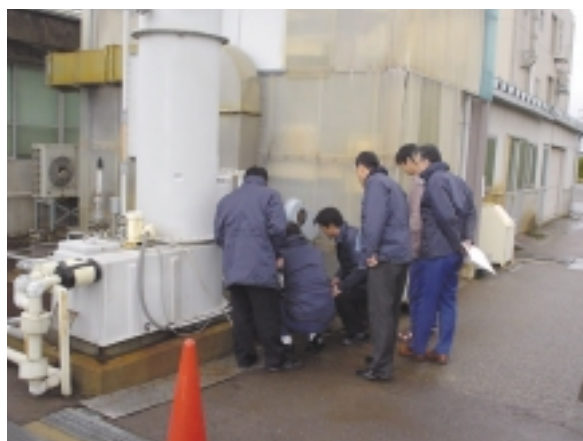
Functional staff audit underway at Hakui Murata Manufacturing Co., Ltd. in December 2003