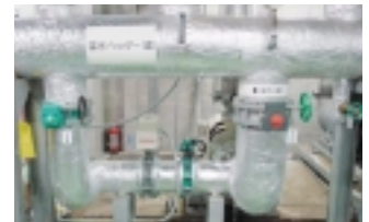
Interlinked air conditioning piping