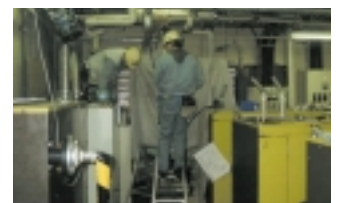
Reduced consumption of compressed air