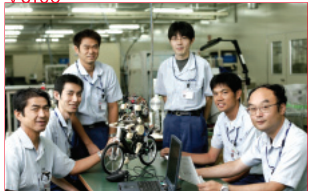
MURATA BOY Development Team members