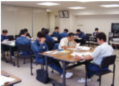
DATA Environmental Education and Training, and Persons with Environmental Qualifications