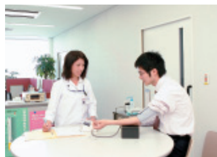
Medical room (Head office)

Promoting the health management and fitness of every employee will make our Company healthy. In other words, a healthy company is created by having healthy employees. Murata therefore endeavors to create a work environment where each employee can cheerfully work with hopes and dreams, while giving consideration to fostering positive mental health and preventing overwork.