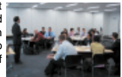
Overseas local manager training

Murata operates over 50 subsidiaries in Japan and in overseas countries. We carry out our business activities with the idea that we should play a role in the development of the electronics industry in countries where our subsidiaries are located, and therefore conduct organizational operations by employing various types of personnel. At overseas sites, we are also active in employing and recruiting local people, and implementing management training programs for locally hired managerial staff, ranging from newly appointed managers to senior managers, with the aim of sharing our ideas with them.