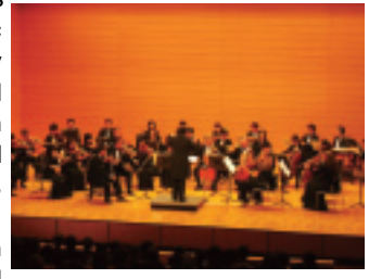
which Murata's Head Classic concert Office is located.

Organizing Concerts Murata holds Classic concerts at a hall newly built in Murata's Head Office in 2004, to which are invited professional orchestras from various regions, including Nagaokakyo City, in which Murata's Head