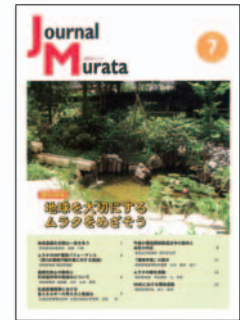
Our in-house publication, Journal Murata , includes an annual environmental feature, facilitating sharing of information by showcasing the progress of and case studies for environmental measures throughout the Company.

The results of our fiscal 2006 internal audit showed four cases of nonconformance and 298 cases in need of improvement for the Murata Group in Japan. Remedial action was completed for 290 cases by the end of fiscal 2006. The remaining eight cases were resolved by the end of July 2007.