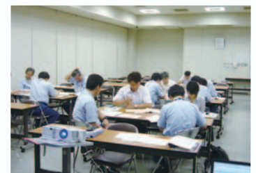
Courses for staff to train as internal environmental auditors include intensive drills and training to foster practical expertise.

Specifically, we organize dedicated environmental education programs for new, existing and managerial staff members and offer training courses to cultivate internal environmental auditors and individual education programs for employees in roles with potential high environmental impact.