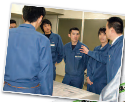
Environmental training focusing on emergency response