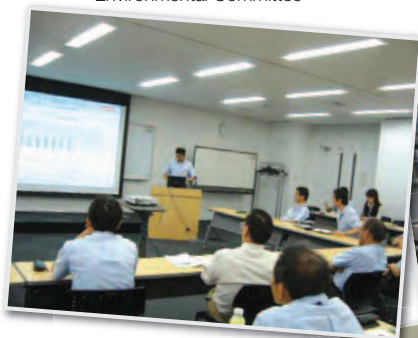
International environmental audit