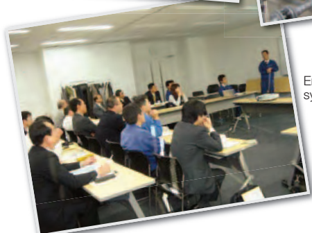
Environmental management system staff's meeting