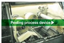
Recycling of Ceramic-Coated PET Film*

concentrator that reduces waste liquids to approximately 1/20th of their original volume. As a result, in fiscal 2008 we reduced waste emissions per unit of net production by 48% compared to fiscal 2000.