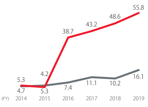
Ratio of females in new graduate, career-track positions Technical positions Clerical positions (%)

* Murata Manufacturing Co., Ltd. on a non-consolidated basis