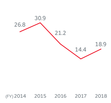
ROIC [pre-tax basis]: Operating income / Invested capital (Property, plant and equipment + Inventories + Trade accounts receiv-able - Trade accounts payable)